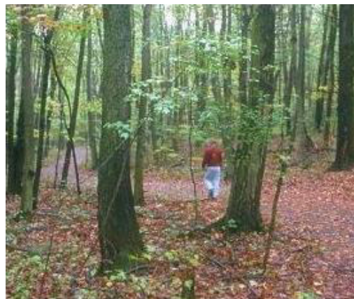
The Joseph E. Ibberson Conservation Area.