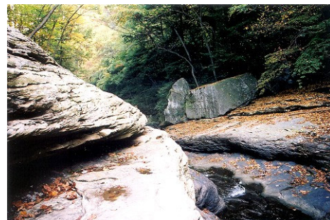
Ohiopyle's own natural waterslide -Meadow Run

19,052-acres of the Laurel Mountains. Throughout the park there are 79 miles of hiking trails, 27 miles of biking trails, 13.2 miles of mountain biking trails, and 9.4 miles for horseback riding. They vary from easy to hard and from short to really long, but all of the trails provide excellent scenery and overlooks of the park and its surrounding areas. Four beautiful waterfalls can be seen along some of the trails, and if you get too hot, there are two natural waterslides in Meadow Run that you can slide down. Also, picnic areas are found throughout the park along with 226 campsites. There are 18,000-acres designated for hunting, trapping, and dog training in the park, however some geographical and seasonal restrictions do apply. Wilderness trout fishing is excellent on the Youghiogheny, which is stocked frequently with trout.