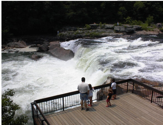
Lookout deck over the Youghiogheny Falls

The parks and forests in the Commonwealth are very beautiful and well kept, however all parks need continuous maintenance and additions to keep them at their best. Adequate funding is essential to keeping our parks from becoming less than what our citizens deserve. Unfortunately recent tax shortfalls have resulted in less money reaching park managers and the backlog of deferred maintenance is mounting. This is why PPFF has begun looking to the business community for support, especially for the parks close to where they are located.