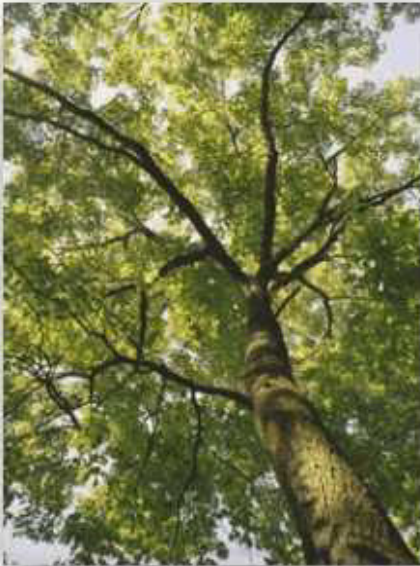
Boyd Big Tree Conservation Area

Land developers are quick to devise new and innovative ways to convert wild spaces into anything from housing developments to shopping malls. They are so successful at what they do that they are consuming 300 plus acres a day in the Commonwealth, all in a state with virtually no population growth. Imagine if conservationists were as innovative in saving what wilderness remains, as developers were in consuming it. Picture farmer's fields reverting back to forests and fields rather than subdivisions. Imagine also that this land would be not only free from consumptive development but would be available for the enjoyment and education of all citizens of the Commonwealth. This land would be used as a place of exercise, contemplation, meditation, and communing with nature.