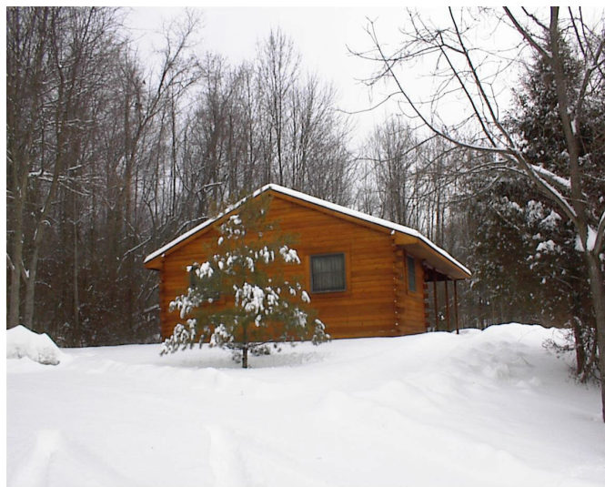
Snowy Cabin at Gifford Pinchot

Check out www.pacleanways.org to find out more about them, and join the fight against illegal dumping and littering.