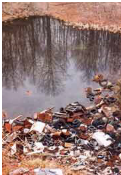
A Dumpsite prior to cleanup-PA Cleanways

PA CleanWays is a non-profit organization formed in 1990 that teams together local community members including local businesses and government to help keep