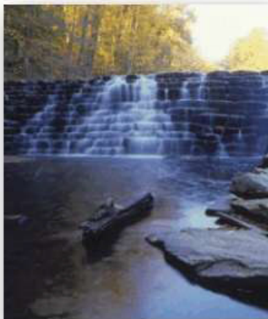
Falls at Laurel Hill State Park

Since the last newsletter, three new friends groups have been added to the previous four groups already involved with PPFF. Locals of Hickory Run State Park, a huge 15,500-acre park in Carbon County, established an official friends group in January of 2004 while friends of Laurel Hill State Park and Ryerson Station State Park both formed in May of 2004. Laurel Hill, located in Somerset County, is most famous for its mountainous terrain and trails wondering through huge stands of Hemlock trees. While Ryerson Station in Greene County is a 1,164-acre park with a 62-acre lake.