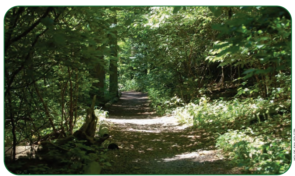
One of the beautiful trails at Nolde.