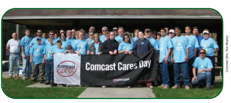
Comcast Cares Day volunteers at Colonel Denning State Park.

We want to thank Comcast and all who volunteered to make their parks a better place to recreate!