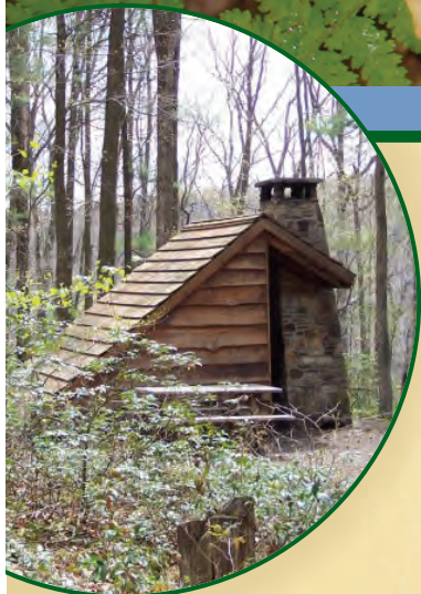
Oil Creek State Park