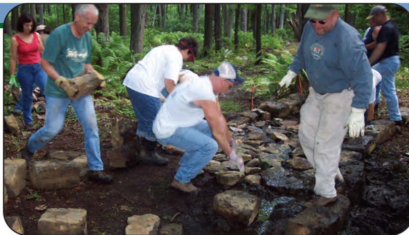
Volunteers help rebuild a fallen portion of the creek.

Wish List: The group would really like an All-Terrain-Carrier. They are in need of motorized equipment like this to move resurfacing materials to trail sections they work on throughout the year.