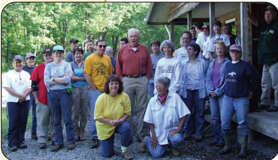
Forbes State Forest Dist. Office