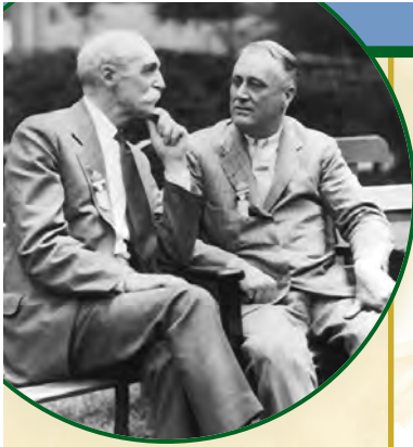
FDR and Pinchot