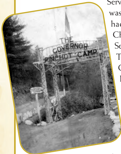
The S-129 CCC camp was located at the present day Little Pine State Park.

The former Department of Forests and Waters worked directly with the Forest Service. Gifford Pinchot was the Governor and had been the first Chief of the Forest Service under President Teddy Roosevelt, and Gifford also had FDR's ear. Pinchot was the reason for the success of the CCC in Pennsylvania.