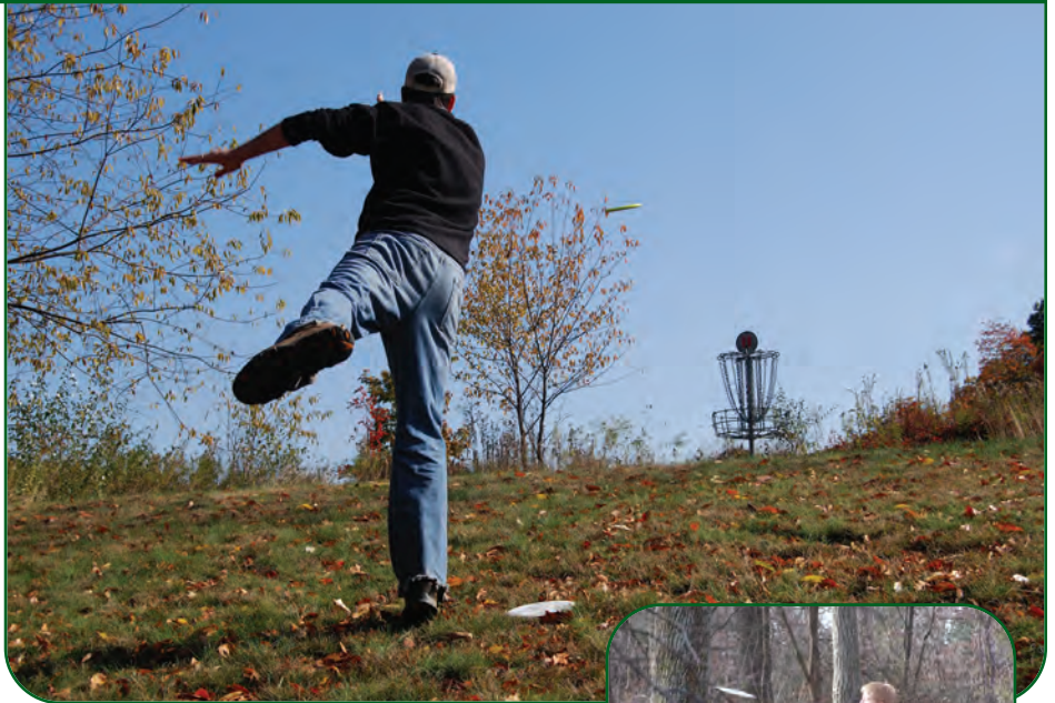
Disc Golf at Moraine State Park.