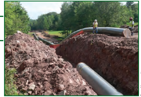
Millennium pipeline construction in Sullivan county NY. The Millennium pipeline runs along New York's Southern Tier and underwent a major expansion in 2008.

Hydraulic fracturing, or 'fracing' consists of pumping a fluid and a propping material such as sand down the well bore under high pressure to create fractures in the shale. The propping material (usually referred to as a "proppant") holds the fractures open, allowing gas to flow out of the shale into the well bore. Hydraulic fracturing of the Marcellus Shale requires large