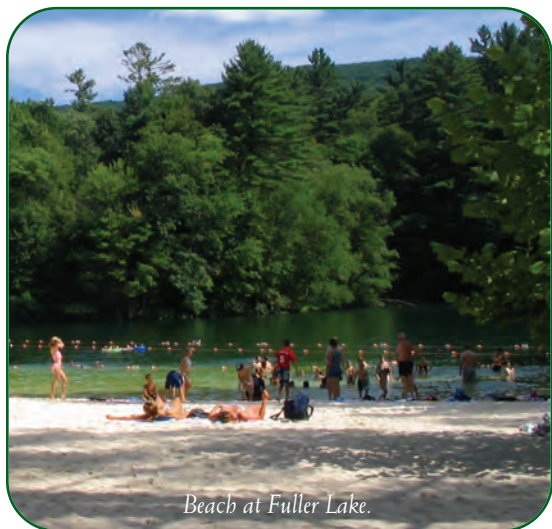
Beach at Fuller Lake.

Hint: If you'd signed up for our e-Blasts (see page 2), you'd already know about this!