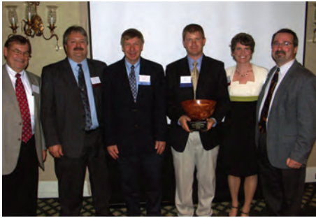
Forest of the Year.