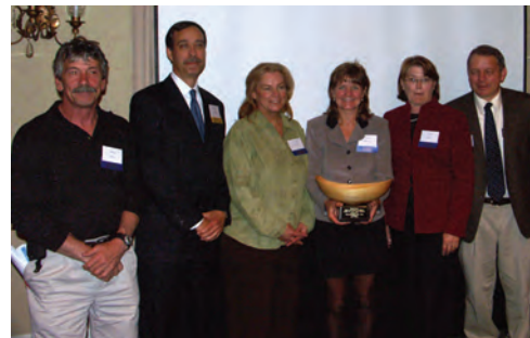
Park of the Year.