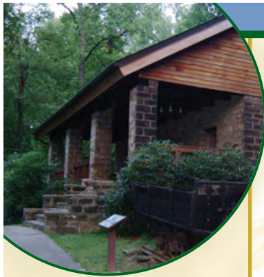
Keystone State Park.