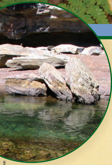
Loyalsock Creek at Worlds End—perfect for a staycation.