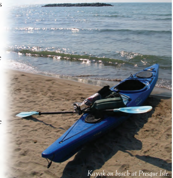
Kayak on beach at Presque Isle.