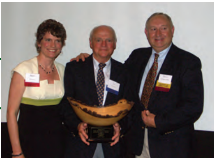
Keystone Legacy Award.