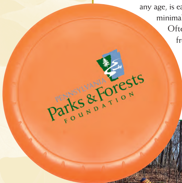
A first try at disc golf at Gifford Pinchot State Park.