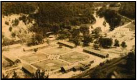
Darling Run Camp (S-155) The Pine Creek Rail Trail passes the former site. The Tioga State Forest has a sign designating the former camp location.

The layout of the S-90 camp was unique. Several buildings, accessible by elaborate wooden steps, were erected on the hillside on a former logging railroad grade. The S-91 and 90 camps