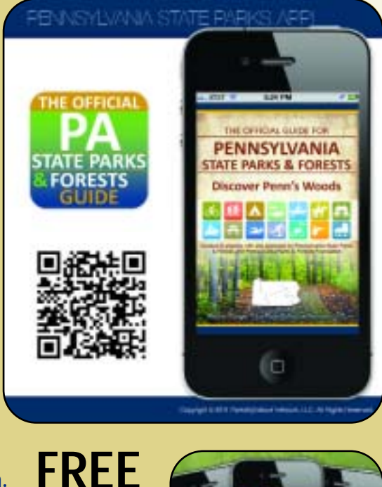
FREE Pennsylvania State Parks & Forests App

The Pennsylvania State Parks and Forests Pocket Ranger® app is now available on iTunes, Android Market and PocketRanger.com. Don't have an Android or Apple phone? The Pocket Ranger® is also formatted as a Mobile Website for ease of use for all Blackberry and feature phone users. The Pocket Ranger Mobile Tour Guide tutorial is available at www.youtube.com/user/PocketRangerApp.