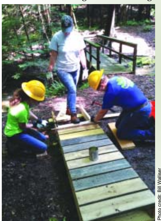
Pennsylvania Outdoor Corps members building a bridge at Goddard State Park.

What if we had a way to both break the cycle of youth unemployment AND foster a more meaningful connection for our young people to the outdoors? Actually, we do. The Pennsylvania Outdoor Corps program hires teams of adolescents and young adults to improve local green spaces and recreational areas. By completing projects that protect natural places and increase access to nature for others, members make tangible and lasting contributions to