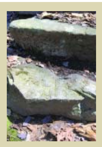
This impression of a leaf is found on a set of steps that assist hikers up a hillside.

Here are examples of a common fossilized tree called Sigillaria, which achieved a height of about 100 feet and required only a few years to mature: