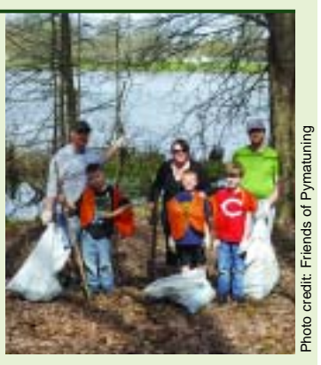
The Friends of Pymatuning's big clean-up event brought out volunteers of all ages.