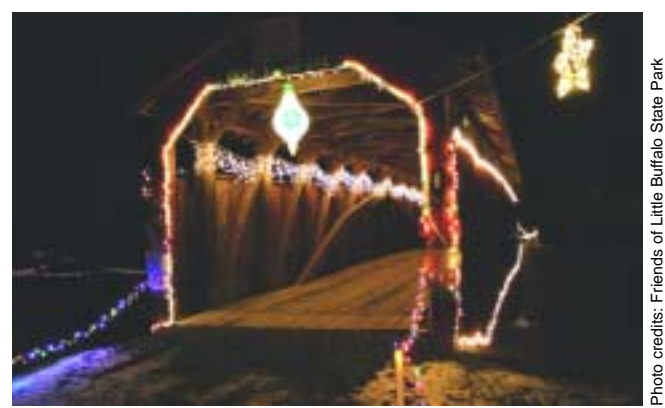
The Friends group sells firewood to raise funds for various events including their Christmas Trail event.

The group's fundraising efforts helped the park place two new playgrounds in less than two years. The first, located near the Entertainment Pavilion, was dedicated in the summer of 2017. The second playground, near the campground, was unveiled for the 2018 season.