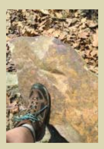
This leaf impression is found trailside and has provided a lot of hikers with a place to take a break!.