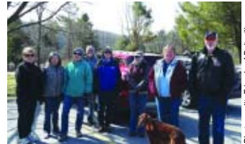
A group gathered for the "Weekly Walk."