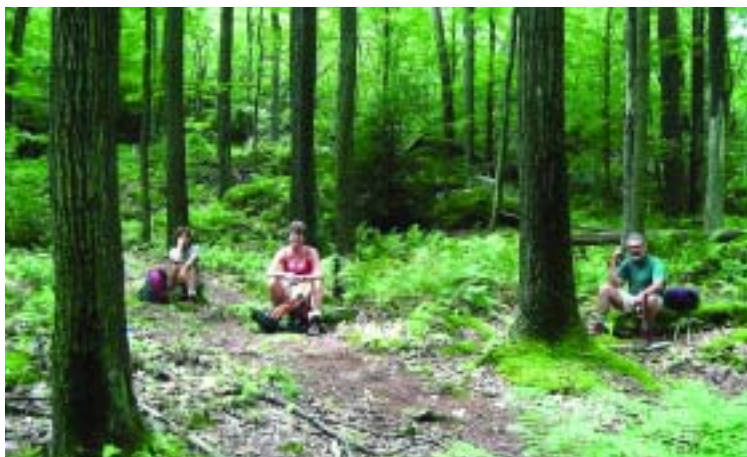
Absorb the Forbes was one of four outdoor events that PPF sponsored in 2007 in partnership with Keystone Trails Association.

For example, in 2007, in partnership with Keystone Trails Association, PPF sponsored four different outdoor events: Oil Creek Outdoors, Hike the Hickory, Prowl the Sproul, and Absorb the Forbes. In 2018, PPF and our Friends hosted more than 115 events attracting more than 118,000 participants.