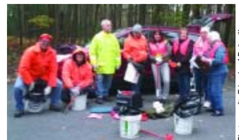
"Keep PA Beautiful" roadside clean up day.