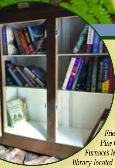
Friends of Pine Grove Furnace's lending library located in the woodshed at the campground.