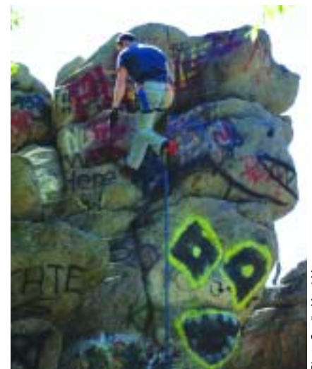
In 2015, "The Stewards of Penn's Woods" launched, a volunteer program geared toward independent spirits who work when they want and when they can.