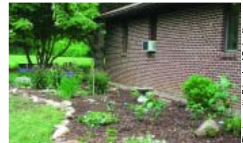
New pollinator garden attracts bees and butterflies.