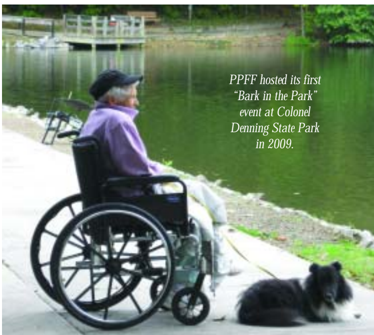
PPFF hosted its first "Bark in the Park" event at Colonel Denning State Park in 2009.