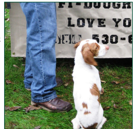
Well-behaved dogs on leashes are an event-organizer’s best friend

Since there will be a lot of different breeds of dogs (and people) at the event, make sure you have signs (and plenty of them) posted and clearly visible to remind everyone to keep their dogs on leash. This is one of the most important items on your to-do list, so be sure every volunteer who works at the Welcome booth (may be a good idea to have one of those) knows to also verbally remind pet owners of this. Also, some dog owners may forget to bring their own waste bags, so be sure to provide waste bags and proper pet waste disposal units to keep the area clean and poo-free.