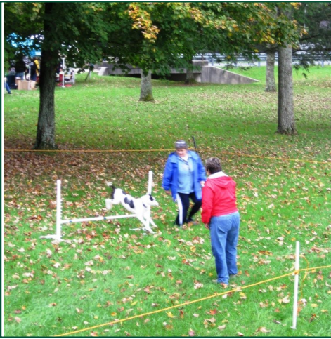
Agility demonstrations are among the most popular exhibits you can offer

for dogs and humans, is also a must in case of any injuries and accidents.