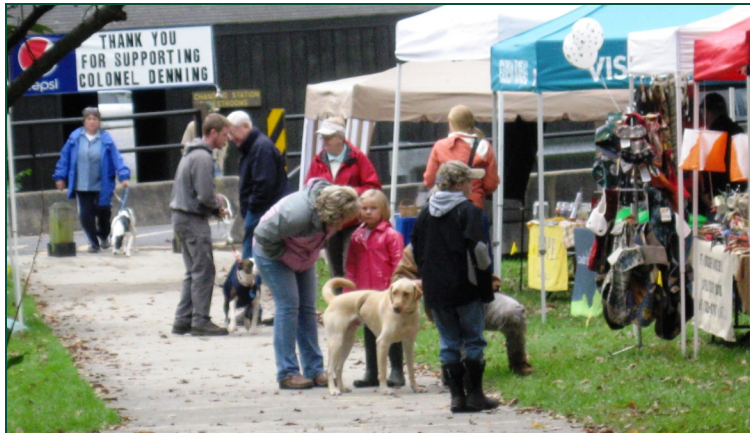
Doggie watching is part of the fun.

Sponsorship. Offering sponsorship and donation benefits can really help you get great dog-related businesses to participate in your event. Provide different monetary levels of participation for various organizations that choose to get involved. Offer things such as an ad in the program, name of the organization on the event T-shirt, a company’s logo featured on a banner, or a booth at the event for them at a discounted rate to promote their business. Remember to create a spreadsheet to keep