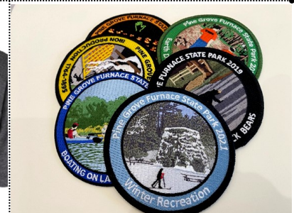
Collect our annual Park patches ($5)