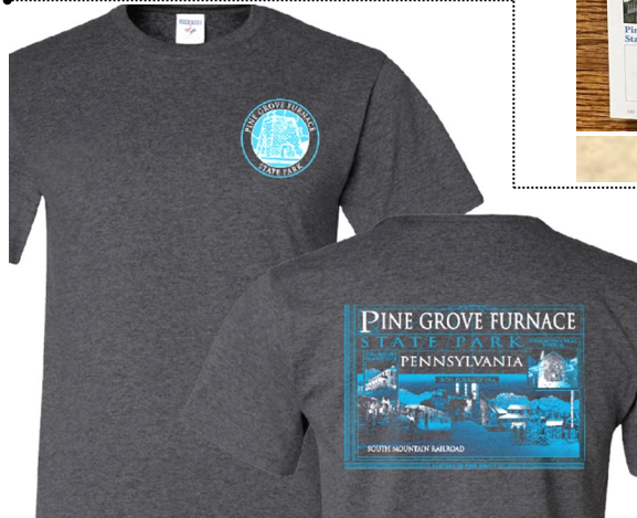
Assorted t-shirts, fleeces, and sweatshirts are available