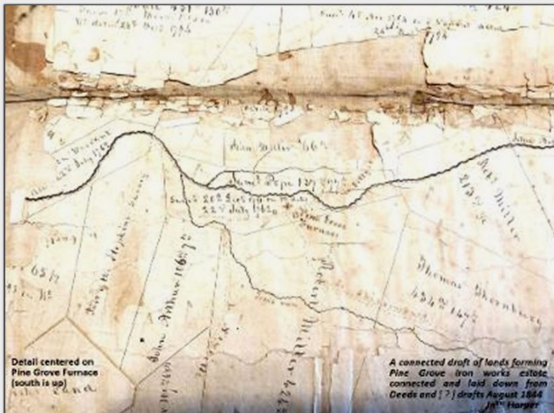
An original 1844 map of the Pine Grove Iron Works estate