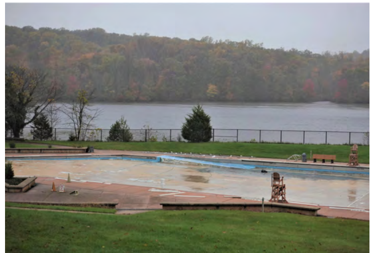
Photos of Park

When it comes to this series at least, we have not come to a park that has had its own swimming pool like French Creek. The pool is open to the public during the summer months and has a great view of Hopewell Lake. It is also worth noting that swimming is only available at the pool, as neither lake is open to it.