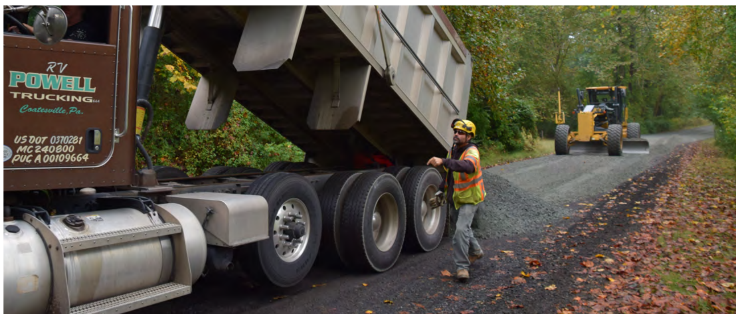
A load of rocks being delivered - by Jack Miller

Final touch - The lines were painted on the new road surface in early November. Please enjoy your Long Term Improvement safely!