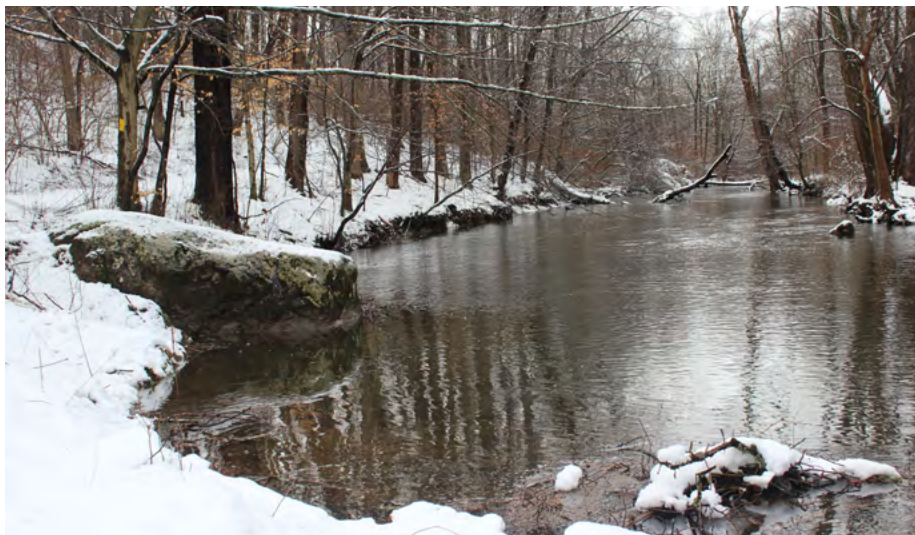
Winter Creek - by Greg Rowan

The hike starts at the parking lot behind Area 8, descends to the creek at Gradyville Road, passes by an area recovering from a tornado in 2019, and winds around a lovely wooded section up and over Hunting Hill and the Russel Cemetery. The trail is wide, mostly gravel, with good footing. Be prepared for early January weather conditions, and for elevation gains of about 350 ft.